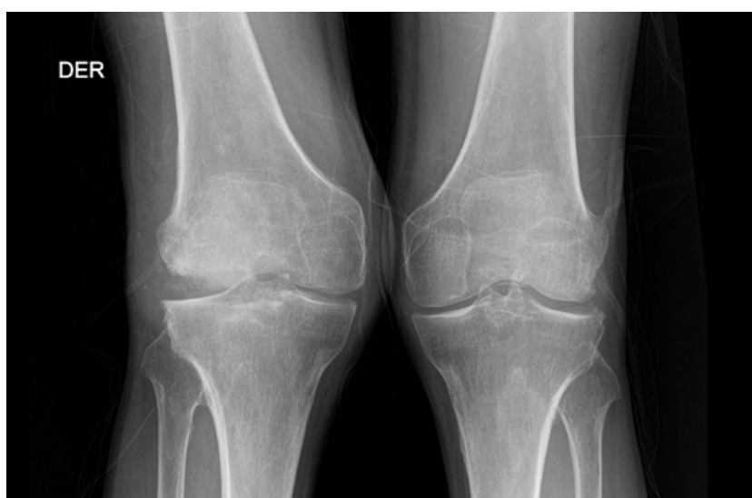
Figure 3. Comparative X-ray of the knee. Osteoarthritis of both knees and bone erosions in the external femoral condyle and tibial plateau of the right knee.

and loss of bone continuity in the right external femoral condyle, while the tomography confirmed the findings, also finding destruction of the right external tibial plateau and multiple bone fragments (figures 3 and 4).