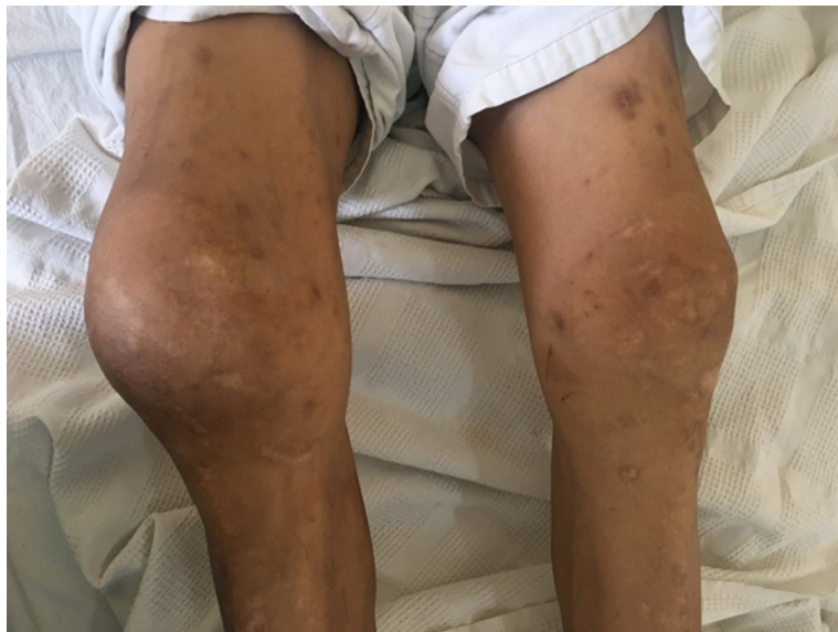
Figure 1. Clinical findings. Trophic changes in the skin, muscle hypotrophy, and volume increase of the right knee without erythema.

General examination revealed multiple hypochromic macules and loss of hair on the skin of the lower limbs, in addition to a superficial ulcer on the sole of the left forefoot at the level of the fifth metatarsophalangeal joint. Muscular hypotrophy of both legs was found in the locomotor examination, in the right knee an increase in volume and deformation was observed with signs of joint effusion accompanied by an increase in temperature and without erythema, a hard and mobile mass of approximately 2cm in the region was also palpated in the external femoral condyle. The absence of the fourth and fifth toes of the right foot and the second and third toes of the left foot was also evident due to what was already mentioned. (Figure 1).