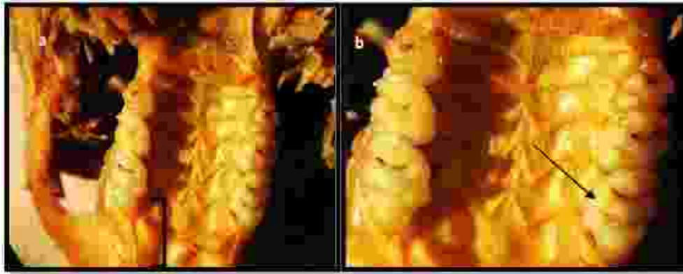
Figure 2. Rattus rattus rodent dentition. a.- the incisor foramen reaches the anterior edge of the maxillary first molar or literally extends beyond it. b.- the anterior fold of the upper first molar is trilobed