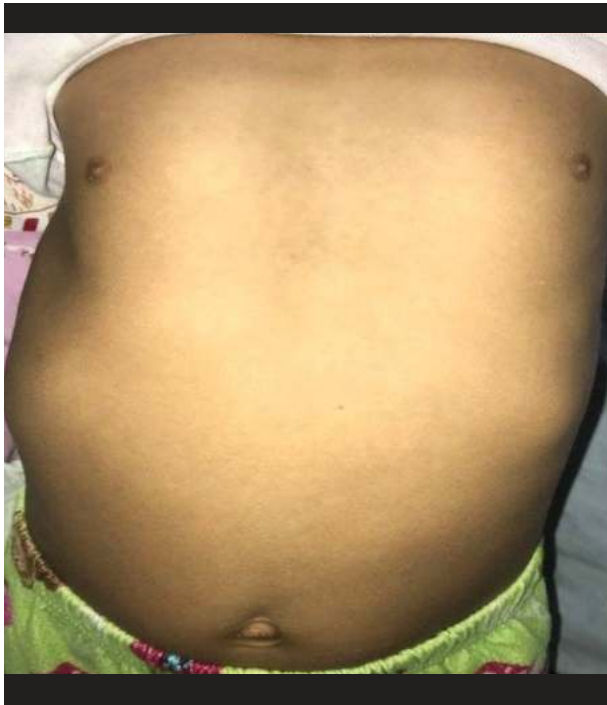
Figure 1. Asymmetry of right chest.